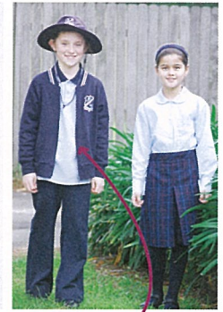
Winter Girls Pant, Unisex Polo & Unisex Fleece Jacket