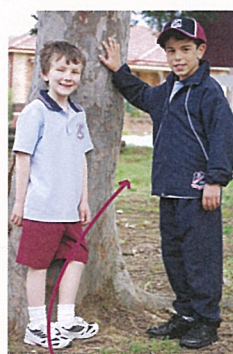
Unisex Sport Uniform Options