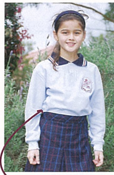
Unisex Long Sleeve Polo, with Skirt