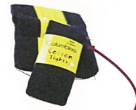
Columbine Navy Tights