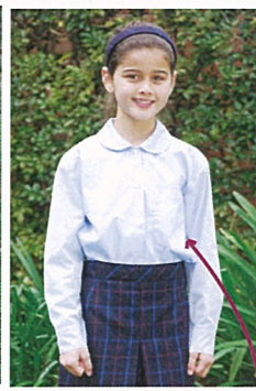
Peter Pan Shirt, with Skirt