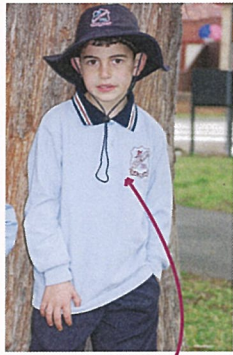
Boys Winter Uniform with School Hat