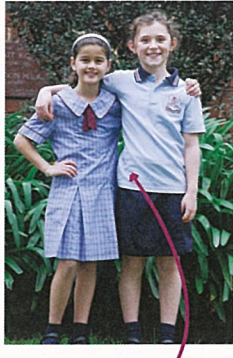
Girls Summer Options