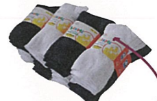
Prosper White & Navy 3pk Sport Socks