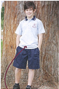
Unisex Summer Polo, Navy Shorts & Socks