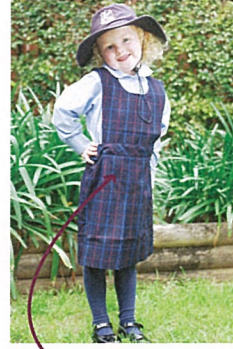
Winter Girls Tunic with bib, Peter Pan Shirt & Navy Tights