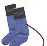
PSSA Yr's 3-6 Sock