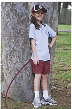
Unisex Summer Polo, Unisex Short & PSSA Cap