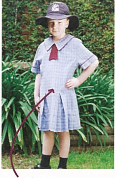
Summer Girls Tunic School Hat & Socks