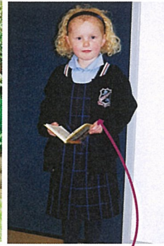
Winter Tunic, Unisex fleece Jacket