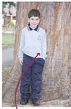
Unisex Long Sleeve Winter Polo & Navy Long Pant