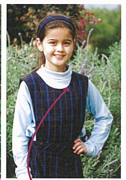
Skivvy, with Skirt & Bib