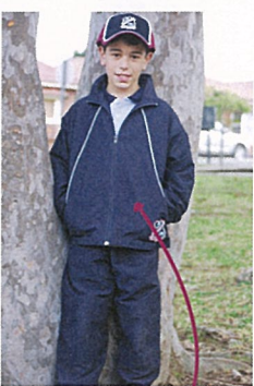
Unisex Winter Sport Uniform - microfibre tracksuit & Polo Shirt