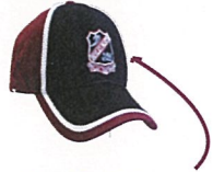
Yrs 3-6 Sport Cap